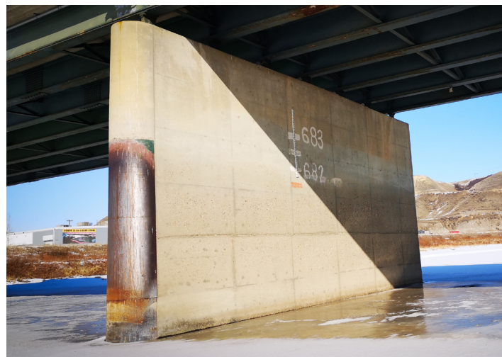
Gordon Taylor Bridge February 2020