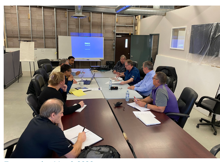
Team meeting March 2020