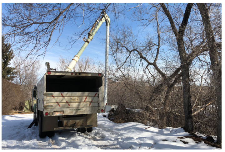
Drainage ditch clearing of fallen tree debris to facilitate inspection