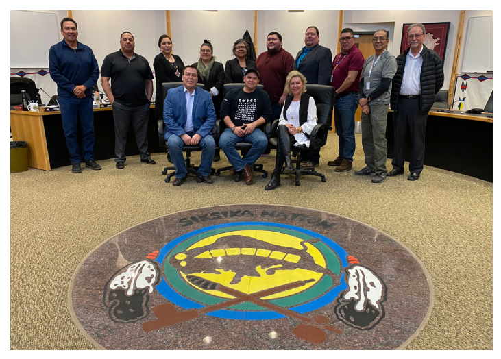
Mayor Colberg attends Siksika Nation Council meeting March 2020