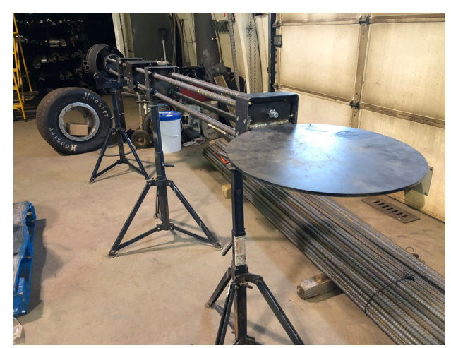
Way Find Sign manufacturing for passive water earnings. Manufactured locally. Garry's Welding.