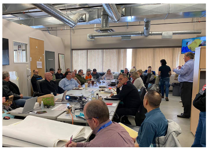
Drumheller Emergency Management Agency activation March 2020

As we continue to update the MEP, we are also working on developing and expanding it beyond planned success and focusing on recovery by awfulizing potential event scenarios.