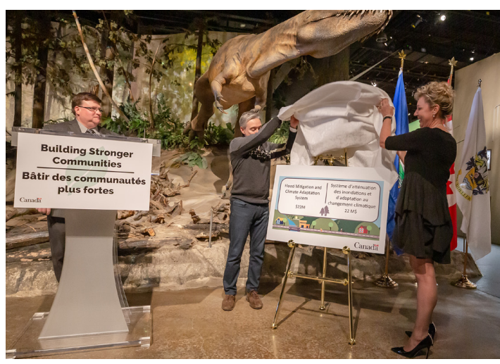
Honourable François-Philippe Champagne, Minister of Infrastructure and Communities , Mayor Colberg and Councilor Jay Garbutt announce DMAF funding to Town of Drumheller

In March 2019, the Government of Canada committed funding in the amount of $22M to Drumheller's Flood Mitigation and Climate Adaptation System through the Government of Canada's Disaster Mitigation and Adaptation Fund (DMAF). The Government of Alberta also committed $28M in funding to this project through the Alberta Community Resiliency Program (ACRP). With the additional municipal investment of $5M, a total of $55M has been dedicated to the Drumheller Flood Mitigation and Climate Adaptation System to change the channel on flood readiness in the community.